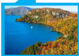
Lake Towada image