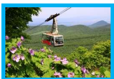
Hakkoda Ropeway image

※The JR EAST PASS is not valid for Sanriku Railway.